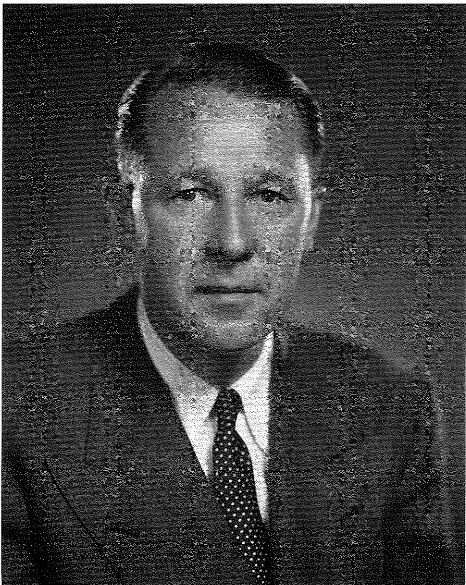
Leonard E. Read